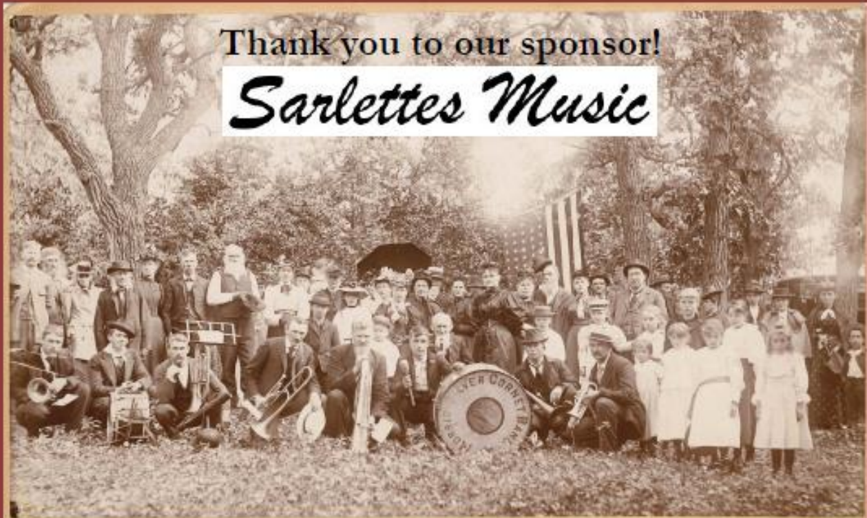
Exhibit on display Now - May 28, 2021

Stevens County Historical Society & Museum